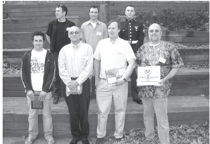
Awards given to our dedicated volunteers at the 15th Anniversary Celebration

P4P again made use of its relationship with FedEx, which permitted P4P to receive bicycles collected in Burlington VT. The Green Mountain Returned Peace Corps volunteers of Vermont collected and processed over 400 bikes during 2006. FedEx is limiting its charitable freight in 2007 and it is unlikely we will be able to rely on them for getting our bikes