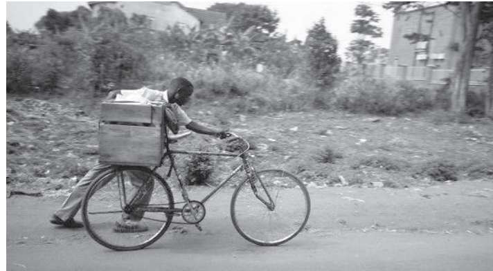
Ugandan man transporting weekly provisions.

Ecología y Tecnología (EcoTec), Jinotepe, Carazo, Nicaragua, is a small business promoting environmentally-sound transportation in urban and rural areas of the coffee-growing highlands; 1,588 bicycles and 17 sewing machines in