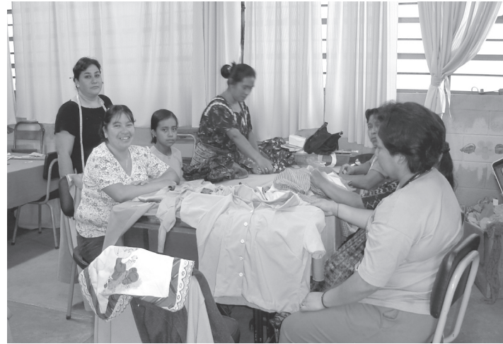
Women participating in the year long sewing course at FIDESMA.

Above all, financial constraints of not completing our capital campaign yet have held the organization back. The capital campaign to build a New Jersey shipping facility showed greatly improved growth (19% gain) yet this still far from complete.