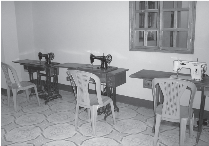
Sewing workshop in the House of the Woman in Nandiamé, Nicaragua

and health services in this impoverished region of Eastern Europe's poorest country. While this program did not receive a container in 2006, it is considered active and we do have plans for a shipment in April of 2007. 1,336 bicycles have been shipped since 2002.