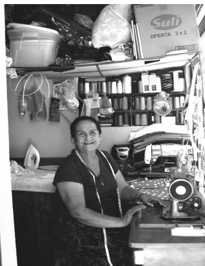
Partner in Guatemala makes school uniforms.

In 2000, P4P sent its first sewing machine and discovered that these machines are in demand in the same places where our bicycles have changed so many lives for the better. Plenty of unwanted portable sewing machines exist in people's homes. They're often headed for a landfill or languishing in a closet.