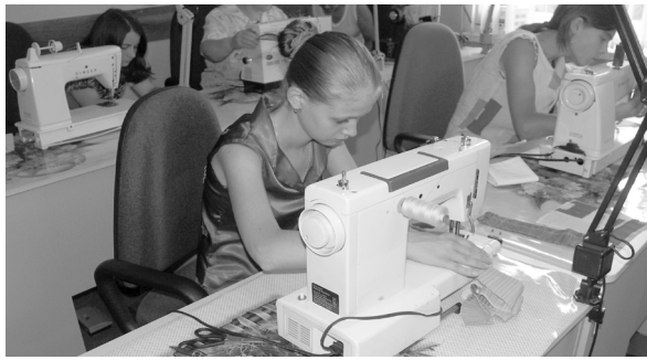
Budding fashionistas in Mooldova.