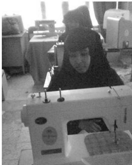
The Burqua factory in Yemen.

Cooperatives of young women in Moldova, Georgia, Krygystan; A Technical Institute in Uganda which after teaching a basic sewing class has distributed 270 sewing machines to its pupils. 456 machines