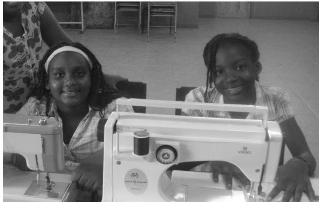
Middle school students in St. Vincent.

A middle school home economics classroom on the island of St. Vincent in the Caribbean;