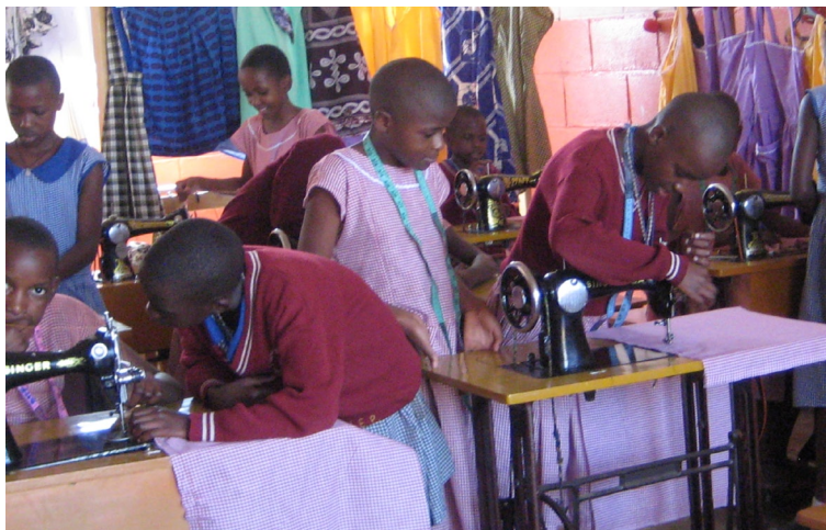
Students hard at work at EIT in Kampala.