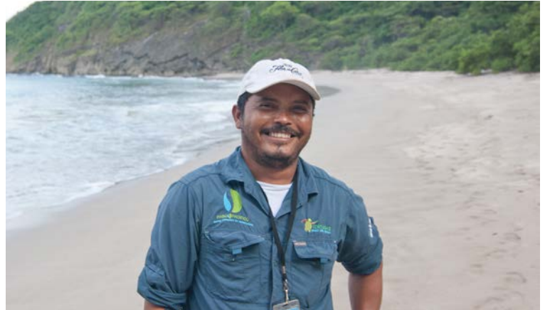
Ranger patrolling the beach in Paso del Ismto.

The rangers work in the Paso del Ismto, a narrow isthmus of land in southwestern Nicaragua between Lake Nicaragua and the Pacific ocean. This area is characterized as dry tropical forest where an intense rainy season is followed by extremely dry conditions every year. Rich in biodiversity and a crucial corridor for birds, mammals and amphibians, it has been devastated by extreme deforestation, resulting in habitat destruction and migratory cor