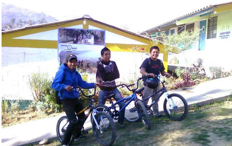
Outside of the FIDESMA office in San Andres de Itzapa.

Three young men, poor students, were awarded a grant from FIDESMA for employment training in welding. The funds were raised through the sale of the bicycles sent from P4P. Without the bicycles that were transformed into needed funds, these young men could not possibly have begun, much less finished, the four months of required training. They completed their course in November of 2013.