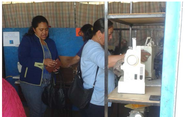
Customers looking to purchase sewing machines at the FIDESMA office.

blouses mostly. These are traditional garments that are loose fitting like a tunic. Since these kinds of shirts are in demand, they stand to make a reliable income continuing to sew these and other viable pieces of clothing. There are more men and women who will be able to access these machines and learn how to use them or continue to work at their tailoring businesses.