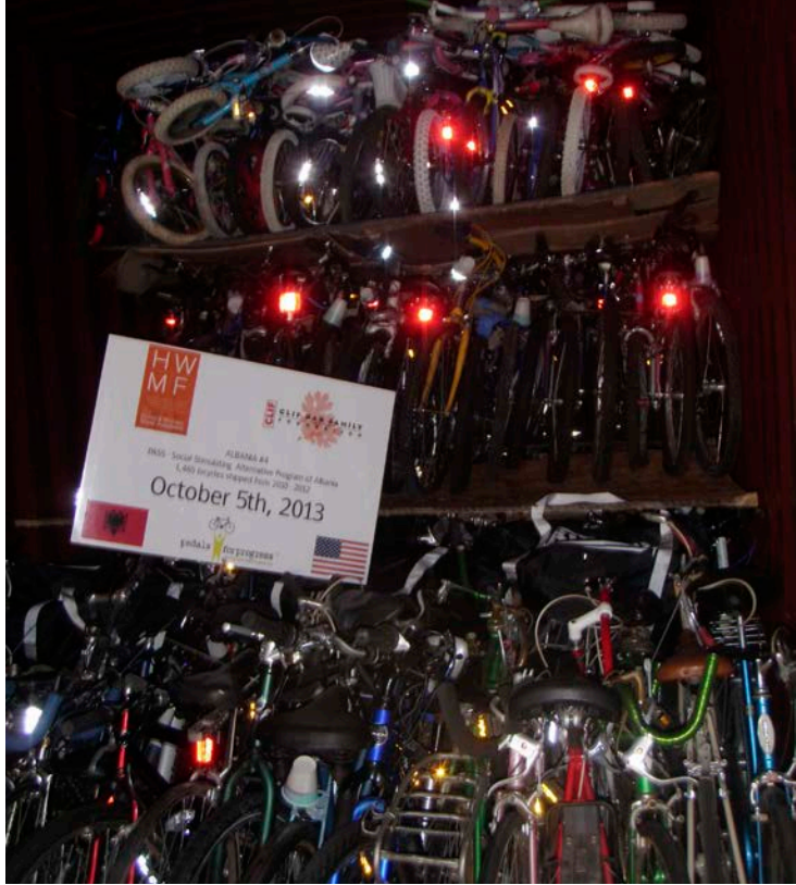
The container packed in NJ enroute for Albania on October 5, 2013.

How nice it is to donate a smile! It is a grim fact that some Albanians face the indifference of passers by and the silence of fellow citizens in general. Many children are mired in a cycle of hopeless days without experiencing the joys of a real childhood and, confused, stare straight into the future without a sense of hope. Nearly 120 of these children at the Colourful Lodge and its twin centers, every day, find not only hospitality, accommodation and a warm meal, but above all the care, love and why not, the image of what they lack and miss: Home!