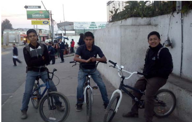
Grant Recipients with their P4P bicycles.

You've read about our partner in Guatemala, FIDESMA, the organization that promotes economic development through micro credit, training in textile design and agricultural programs, among other efforts. They are doing so much to contribute to the needs of the people in their region and we are pleased to have some updates for you.