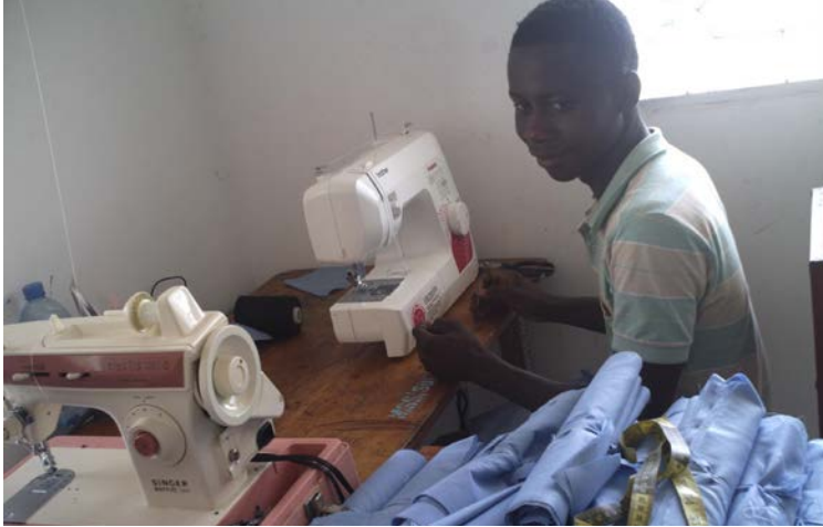
Student with his P4P sewing machine.

In October of 2013, with the generous support of grant money from one of our valued supporters, Clif Bar family foundation, P4P shipped 41 sewing machines to the region of Dar es Salaam (DSM) in Tanzania. Our partner there, Community Support Mission (CSM), works closely with those in poverty to help them earn their own living and create a healthy and sustainable lifestyle.