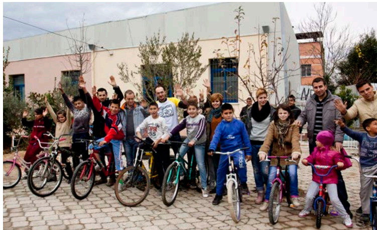
Children outside of the Colourful Lodge facility.

started. We will make other children smile by riding bicycles. And it's not just about entertainment, but also presenting to them the vision of a beloved city, clean, and safe, since they are precisely the ones who walk on these streets every day." It is great discovering that besides the gift of a smile, there has been bestowed upon these children a chance for a new world