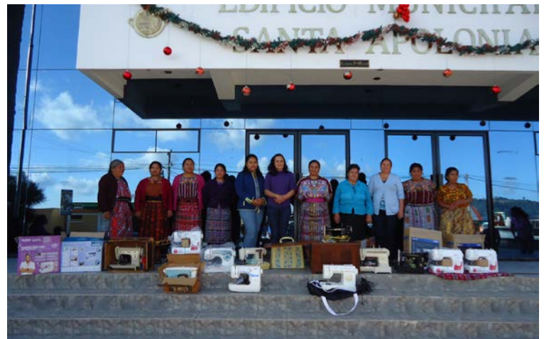
The women outside of the Santa Apolonia Municipal building.

In the container mentioned above, there were also 15 sewing machines, some earmarked for particular women who had visited the FIDESMA training center. These women, from Santa Apolonia in the District of Chimaltenango, work sewing typical huipil