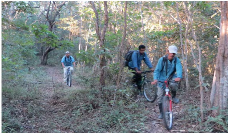
Rangers on their way to the beach.