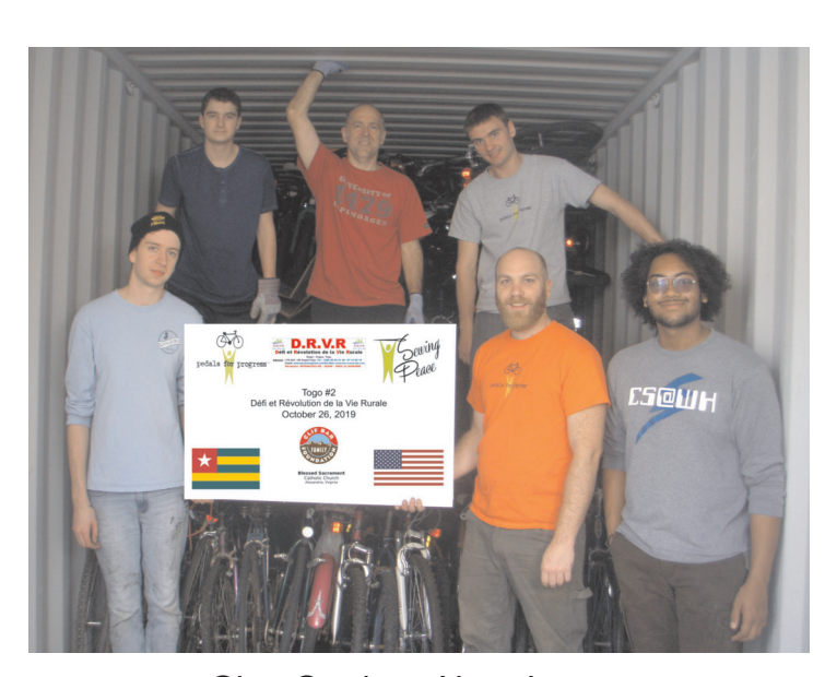
Glen Gardner, New Jersey