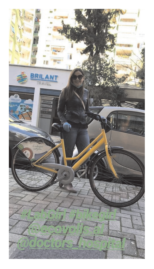
A nurse says thank you.

For doctors, nurses, and hospital staff: free bicycles